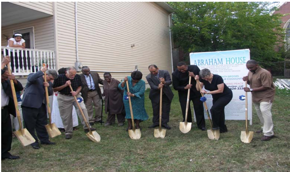
Many Congregations participate in ground breaking.