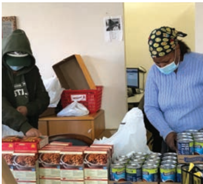
The food pantry at our Hub to provide food assistance for families and children of Newark's West and Central Village.

Community Resource Hub Programs - Habitat for Humanity of Greater Newark ( habitatnewark.org )