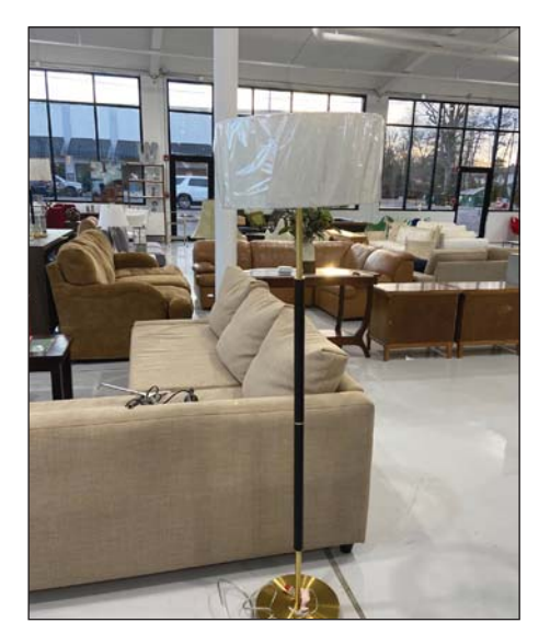
Kitchen cabinets and appliances? Living room furniture? Our ReStore has it all.

Downsizing before a move or clearing out a house? The ReStore has two pickup options. One, a partnership operated with veterans' organization resupplyme, will pick up gently